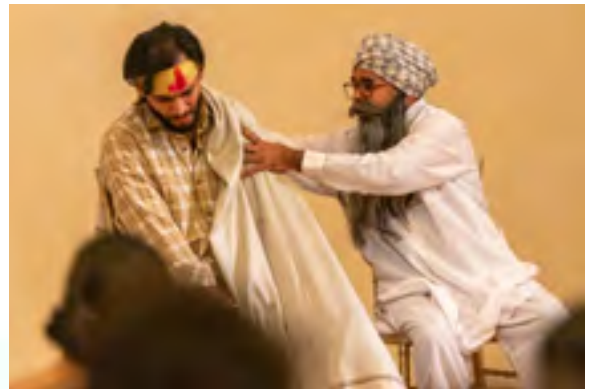
Performance of Jaadge Raho at Fish Interfaith Center during SAFF 2024 Patrons' Night.