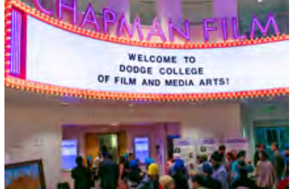
SAFF 2023 Red Carpet Night at Dodge College, Folina Theater.

Through "Project S," Dodge film students travel globally to create 5-7 Sikh-themed films focused on pre-production, filming, and post-production over a credited course taught by Chapman faculty. Past destinations were Thailand, Malawi, the UK, Australia, and France covering topics like a poet, wrestler, blogger, and elected French Sikh official. This January, students will again travel to Thailand.