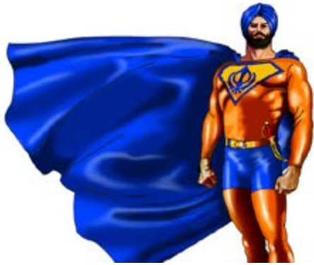
Artwork is represented as the quality of work for proposed films, but is not actual artwork.

SikhLens has also expanded into animation and comic arts. We have enlisted the talents of some great Sikh animators who will be creating one or two films per year on the following subjects: